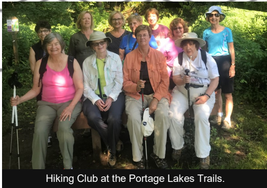
Hiking Club at the Portage Lakes Trails.