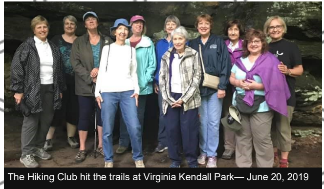
The Hiking Club hit the trails at Virginia Kendall Park— June 20, 2019