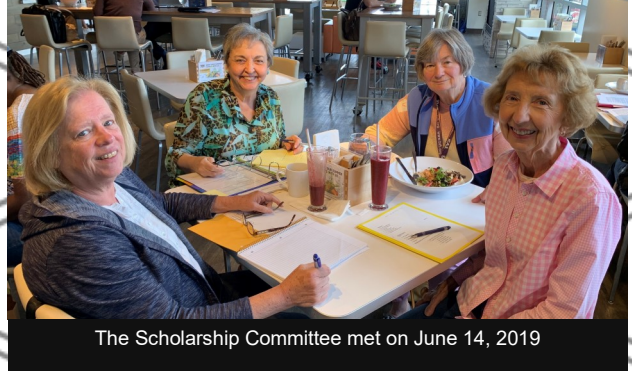
The Scholarship Committee met on June 14, 2019