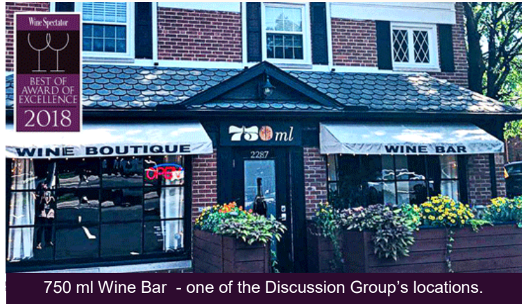
750 ml Wine Bar - one of the Discussion Group's locations.

The group will meet next on Thursday, October 24th (7 p.m.) at the TGIF's Green location, 1039 Interstate Pkwy. at Fortuna Drive. The subject will be Human Trafficking. We hope to see you there.