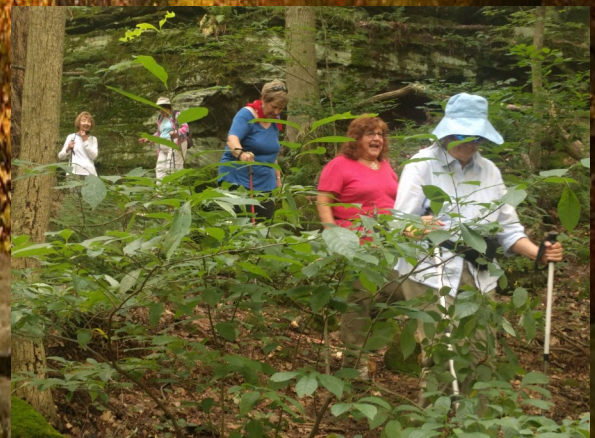
Worden Ledges hike.