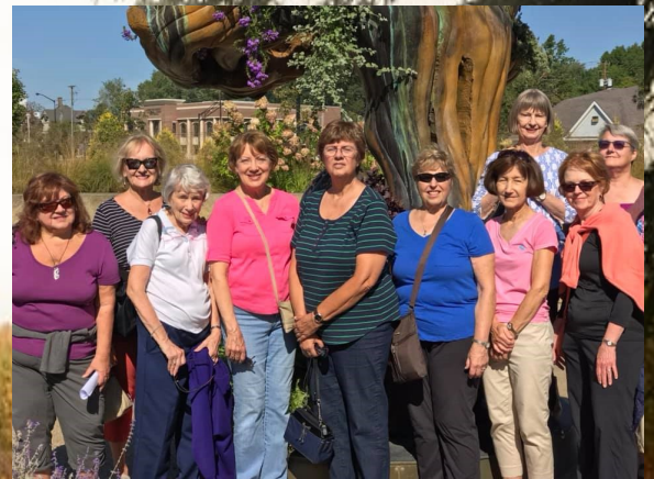
Kent Hike Along the River.