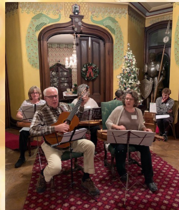
Special guest performers, Dulcimer Strings and Things