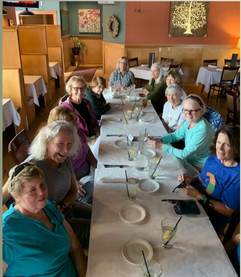
Followed by lunch, October 7, 2021