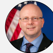
Scott Boalick Former Chief Patent Trial and Appeal Board Judge, United States Patent and Trademark Office