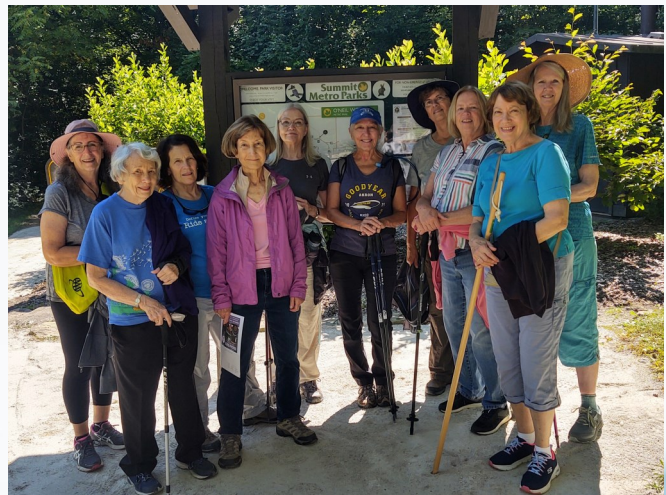
Photo from Buckeye Trail at O'Neil Woods Metro Park Thursday, August 18, 2022