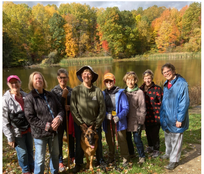
Oak Hill Trailhead in Peninsula—followed by lunch at Fishers Thursday, October 27, 2022