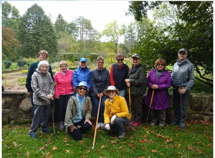
Photo from Quail Hollow Park Thursday, September 29, 2022

Maize Valley Winery and Market was our spot for lunch, located just east of Hartville in an agricultural setting. The chicken dumpling soup and half a sandwich was a hit for several in the group. Then we shopped in the market, which offered Maize Valley wine, various food items, condiments of all sorts, and useful gift items. Quite a destination!