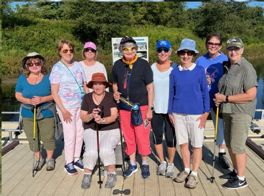
Trail Lake Park Thursday, September 1, 2022