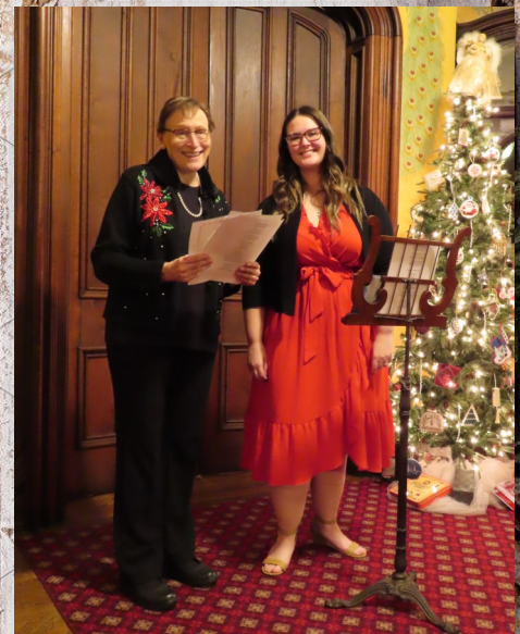
More photos inside ...