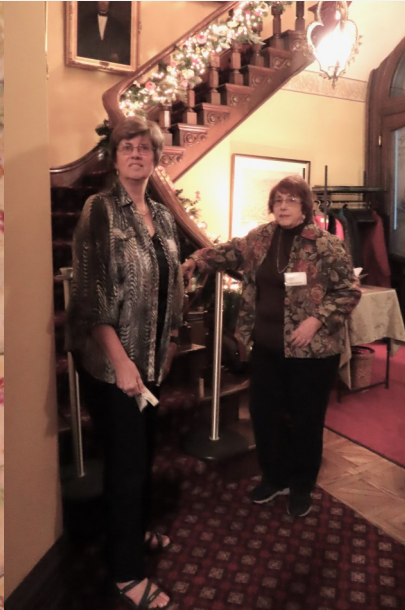
More photos from the Fall General Meeting